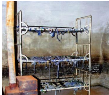
Prison cell with bunk-beds with no mattress, prisoners were obliged to sleep on. Stove for show only, never heated in cold winters.