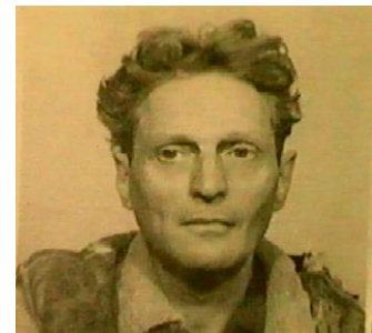
Mug-shot of Late Reverend Richard Wurmbrand when held in the Jilava prison, in communist Romania.